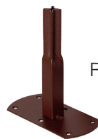
Ref. 3516 (x4)

Pour assurer une stabilité maximum utiliser les accessoires de fixation. To ensure maximum stability use the fixing accessories.